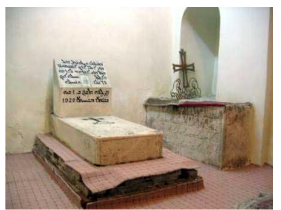
Naneh Maryam Cathedral