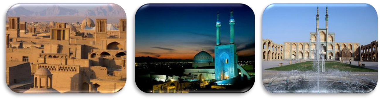
Old part of the Yazd